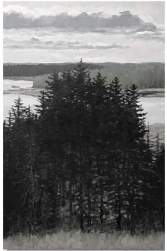
E. A. Crossman "High View, Spring"

Masks and Social Distancing required No more than 5 people at any time