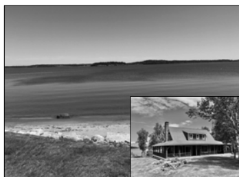
Oceanfront Home with Beach. Post & Beam home just off the Thorofare with deepwater dock, large sandy beach, 12 acres, garage. Stunning! $1,590,000