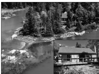
Blackberry Point. Contemporary post and beam on Mill River w/ 20 acres and 2400'+ on Mill River. Attached guest house. Deepwater dock. $975,000