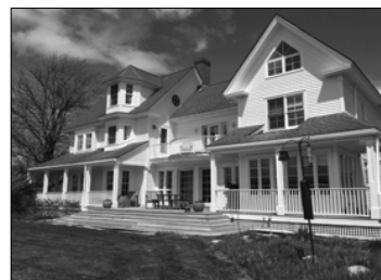
Leo's Lane. Fabulous 5 bdrm, 3 bath 1890s home, w/ deeded harbor access. Excellent craftsmanship and impeccable details. Completely rebuilt. $849,000