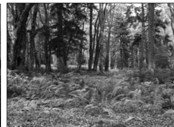
Ten Acre Building Lot Near Village. Lovely lot adjacent to a VLT preserve. 3 bdrm soil test, 30' ROW has been partially cleared. Great value! $84,000