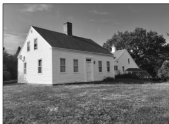
Kelwick Farm. Historic farm with 18 acres and tastefully updated farmhouse. 3 fireplaces, 4 beds/2 baths. Fruit trees, open meadows. Charming! $595,000