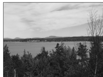
Elevated Building Lot. 3.88 acres w/ granite dock on Seal Cove, just off the Thorofare. Completed survey and soil test. Great sunset views! $525,000