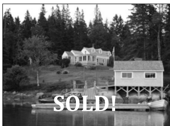
Kingfisher Point. Charming antique cottage w/ 20 acres at the tip of Long Cove. 2 boathouses, guest house, deep-water dock. One of a kind! SOLD!