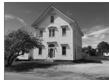
The Schoolhouse. Iconic 2.5 story bldg, designed as an elem. school. Flex 1st flr space, office, 2 apartments. Very well maintained & full of history! $439,000